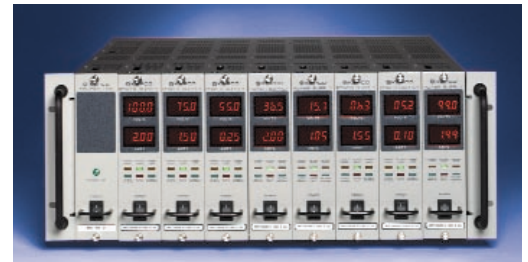
Model MST - 200 Watt