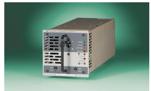
Model HSP - 3.3~ 48V