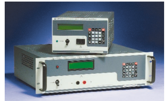
Model BHK-MG - 0-2000V