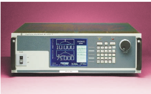
Model BOP High Power - CV/CL, CC/VL