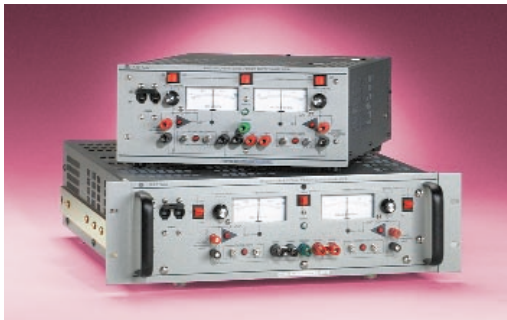
Model BOP - CV/CL, CC/VL