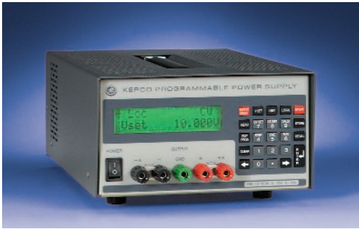
Model ABC - Bench Style