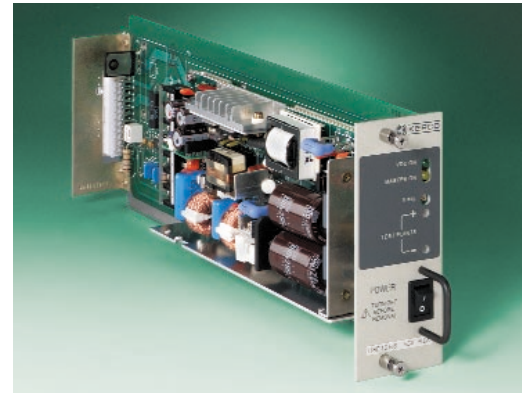
Model HSF - 50-350 Watt