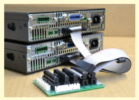
Parallel connection of two identical KLN power supplies (up to five possible) using optional Parallel Socket Board 536-0129 and Programming Port Cable 518-0119