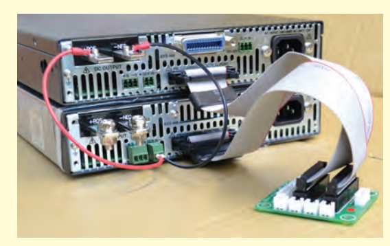
Series connection of two identical KLN power supplies using optional Series Socket Board 536-0130 and Programming Port Cable 518-0119