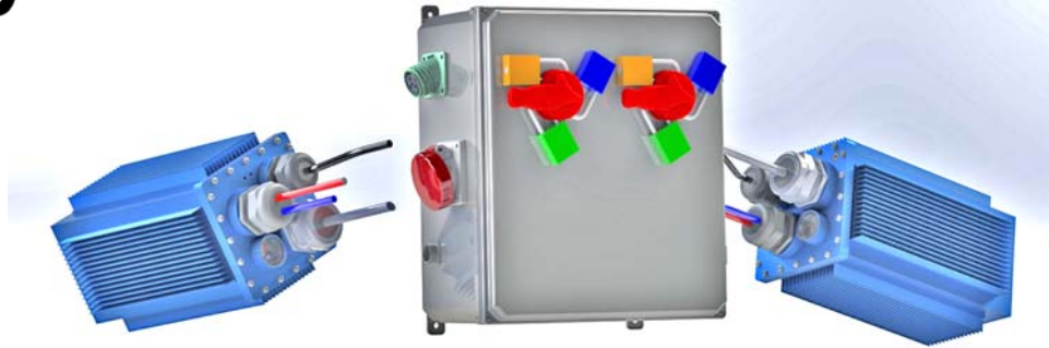
Two KHX modules with Distribution Box Fault Tolerant, N+1 Redundant